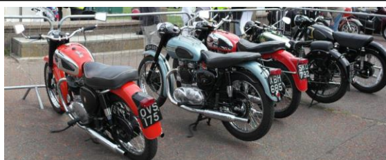
Selection of visiting bikes to our show

If you have any info or photos relevant to the club please pass a copy of them to Beaver for our archives.