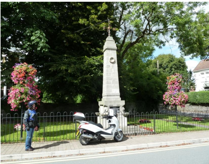
Guardian of the Valley 6 Bells Colliery S Wales

The actual land marks are amazing and very interesting.