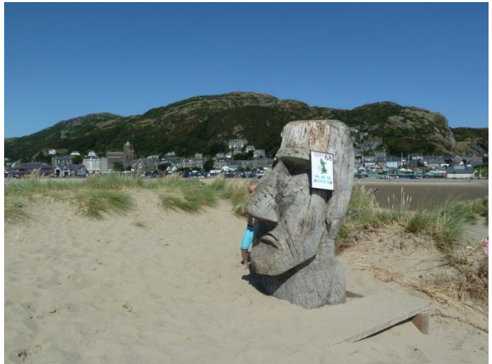
Easter Island Head Barmouth